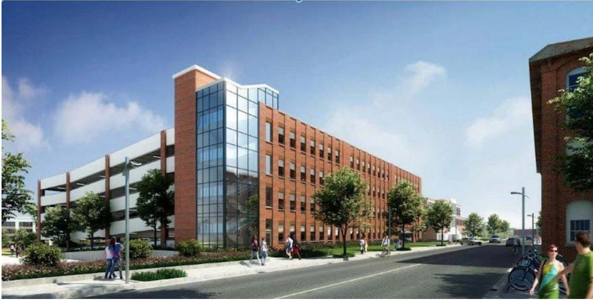
A rendering of the approved 640-space parking garage at the city-owned 3 Lincoln Street property.